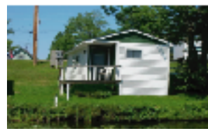
Cottage #11 $65,000

OR RENT $70.00 NIGHTLY $350.00 WK sleeps 2 (1 double bed) Water frontage 33' Acreage 3.5+ common 1 bedroom 1 bath Private septic Water – shared Artesian well Heat – electric Siding- wood Roof – asphalt shingles Foundation – none Mini-refridgerator - kitchen