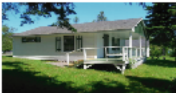
Cottage #8 $120,000

OR RENT $100.00 NIGHTLY $500.00 WK sleeps 2 (1 double bed) Water frontage 54' Acreage 3.5+ common 1 bedroom 1 bath Private septic Water – shared Artesian well Heat – electric Siding- wood Roof – asphalt shingles Foundation – none Separate kitchen & living room