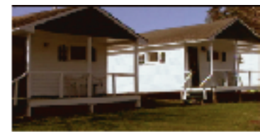
Cottages #12 & 14 $65,000 (each)

OR RENT $65.00 NIGHTLY (each) $325.00 WK (each) sleeps 2 (1 double bed) Water frontage 12 (27') 14 (17') Acreage 3.5+ common 1 bedroom 1 bath Private septic Water – shared Artesian well Heat – electric Siding- wood Roof – asphalt shingles Foundation – none Mini Refridgerator & Microwave