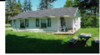
Cottage #7 $190,000

OR RENT $125.00 NIGHTLY $625.00 WK sleeps 4 (2 double beds) Water frontage 90' Acreage 3.5+ common 2 bedrooms 1 bath Private septic Water – shared Artesian well Heat – electric Siding- wood Roof – Asphalt shingles Foundation – none Separate kitchen & living room