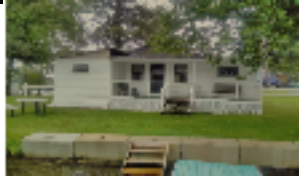
Cottage #4 $165,000

OR RENT $125.00 NIGHTLY $625.00 WK sleeps 6 (3 double beds) Water frontage 58' Acreage 3.5+ common 3 bedrooms 1 bath Private septic Water – shared Artesian well Heat – electric Siding- wood Roof – rolled roofing Foundation – none Separate kitchen, & living room