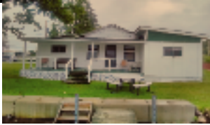
Cottage #3 $165,000

OR RENT $125.00 NIGHTLY $625.00 WK sleeps 6 (3 double beds) Water frontage 58' Acreage 3.5+ common 3 bedrooms 1 bath Private septic Water – shared Artesian well Heat – electric Siding- wood Roof – rolled roofing Foundation – none Separate kitchen, & living room